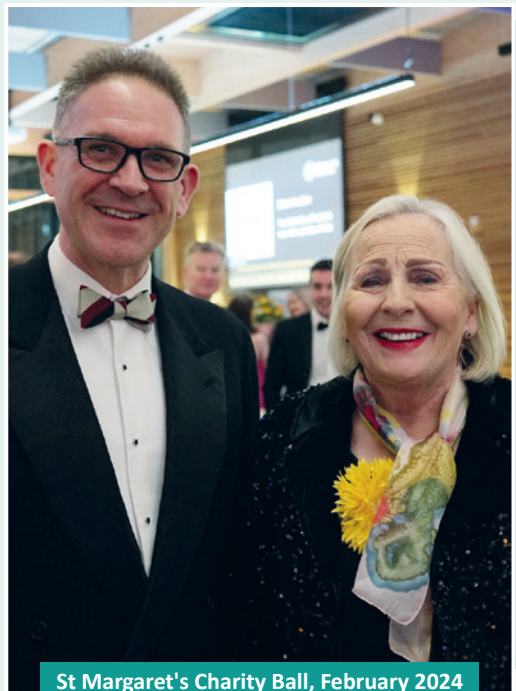
St Margaret's Charity Ball, February 2024